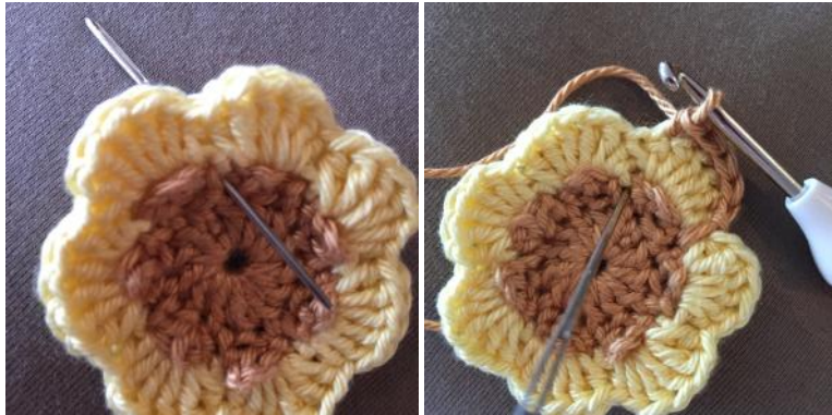
Front and back of The Spring Flower

Sl st in between petals (as shown in pics) in round 2 (same sl st as round 3 sl st in), * skip hdc, 5sc, sl st in round 2 repeat from * for the whole round. Cut yarn and fasten